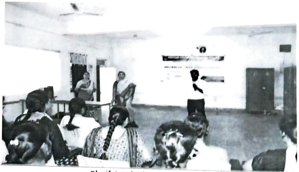
Clarifying doubts in the session