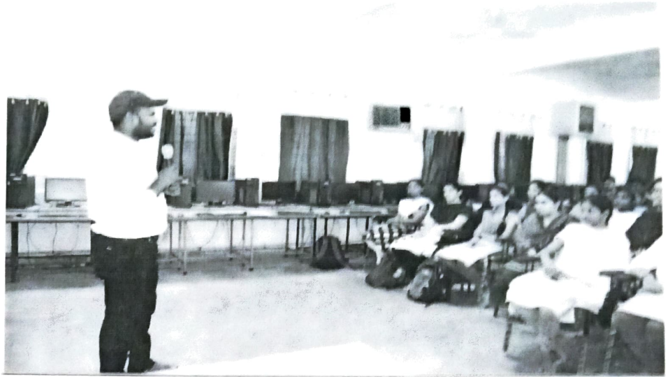
Resource Person interacting with students about the course